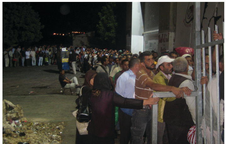
Bethlehem Checkpoint at 4am

The Wall surrounds Qalqilya with only one entry point controlled by Israeli soldiers. Qalqilya is cut off from the rest of the occupied West Bank, punishing all its residents.