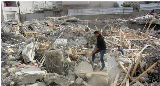
Palestinian homes demolished in East Jerusalem

Israel uses unjust excuses to demolish Palestinian homes to make way for illegal Israeli settlements, for example claiming that Palestinians do not have a ‘permit’ for land they have lived on for generations. Israel has demolished 5000 Palestinian homes in East Jerusalem since 1967.