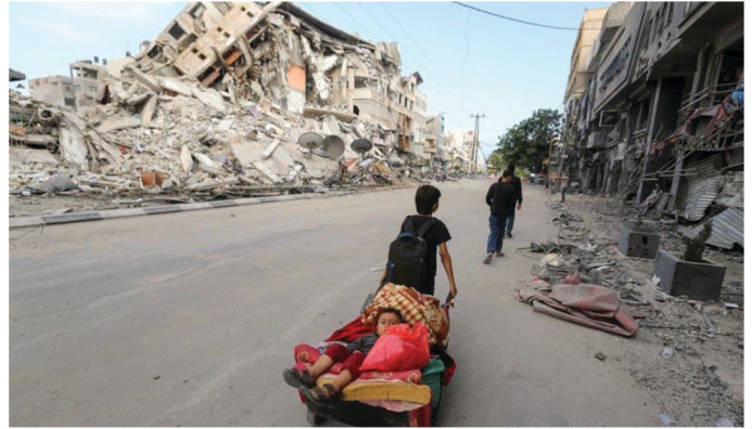
Aftermath of Israeli bombardment on Gaza

Israel prohibits many items from reaching Gaza including food in tin cans and building materials such as wood and concrete.