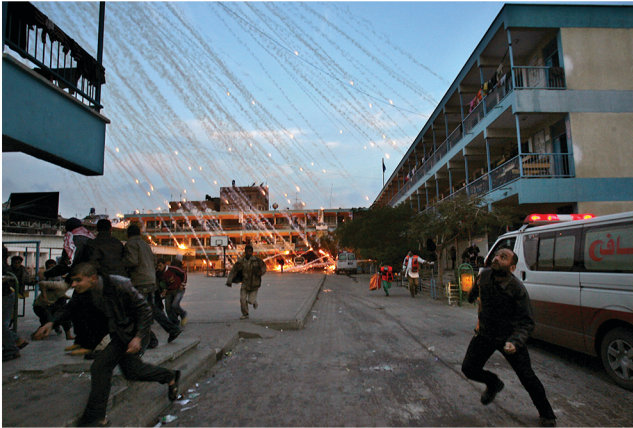
2008: Israeli White Phosphorous attacks on Gaza

Palestinians in Gaza experience frequent brutal bombardments by Israel: