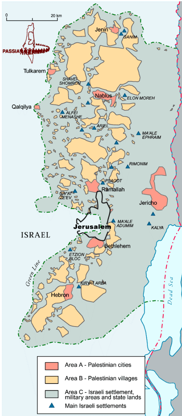
Figure 1: Map of Palestinian territories post-Oslo.