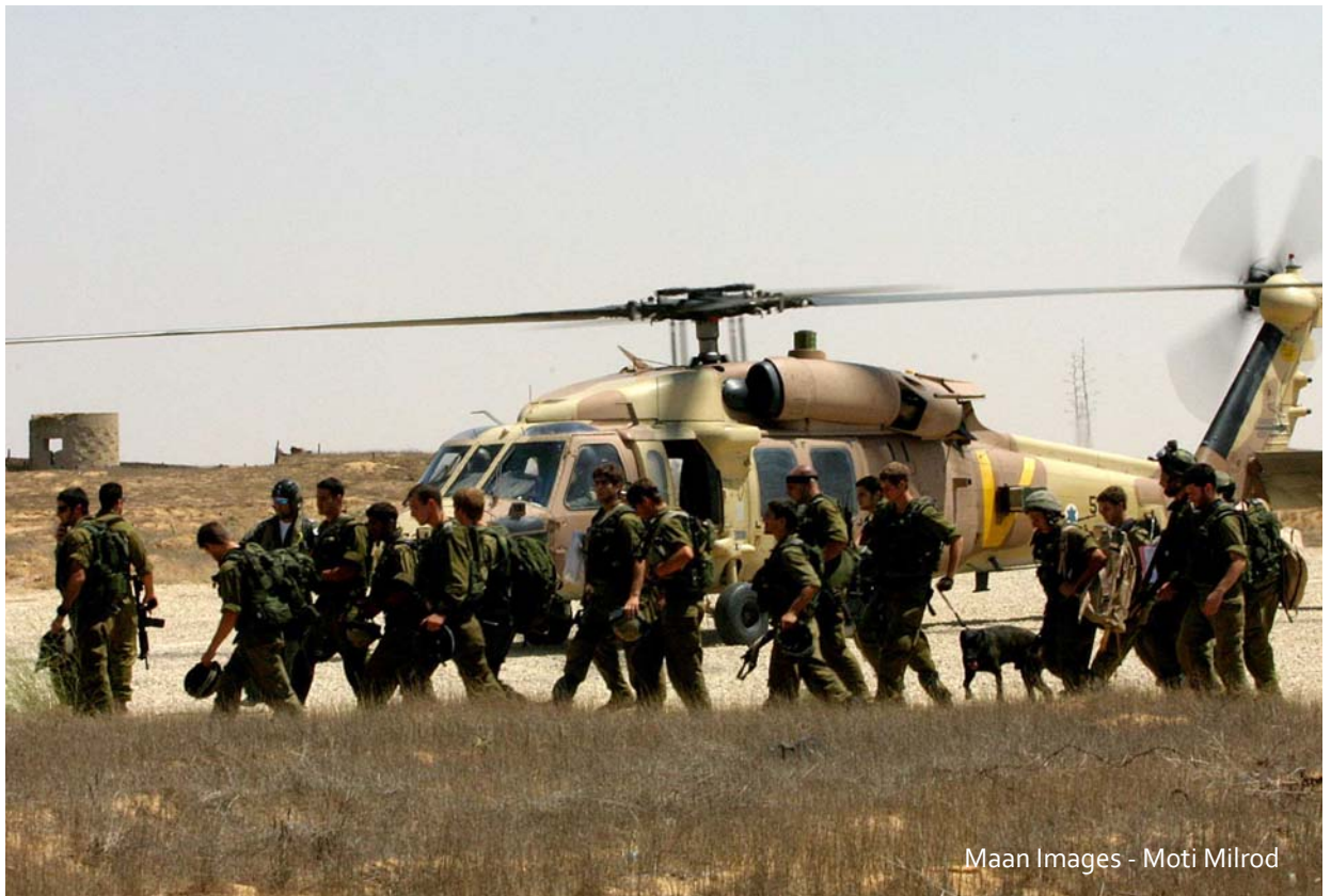
Maan Images - Moti Milrod