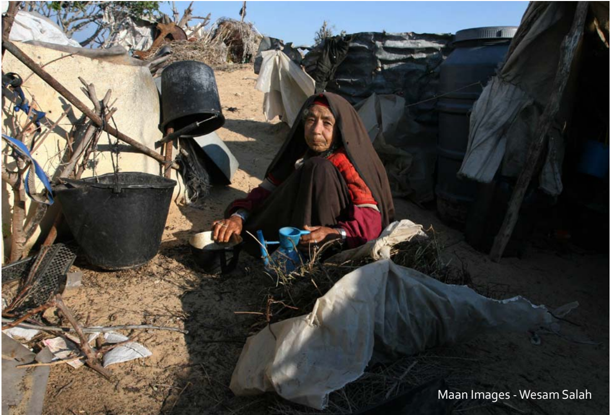
Maan Images - Wesam Salah