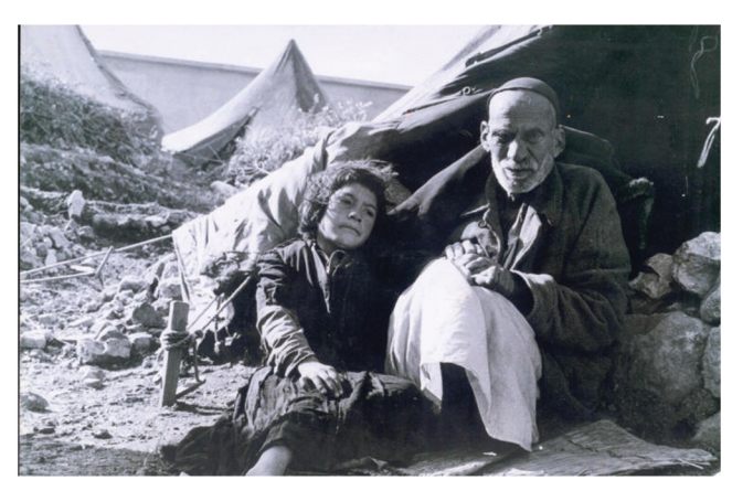
1948: Palestinians made refugees [Wikimedia Commons]

The events which culminated in the Nakba and the birth of Israel in 1948 were decades in the making.