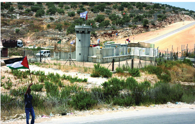
Roads for Israeli access