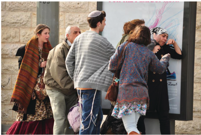
Israeli settlers attack a Palestinian lady

■ Reduced access to infrastructure: As the number of illegal Israeli settlements across the West Bank has increased, new roads have been built to connect them together. 79km of these are Israeli-only and 155km are restricted access to Palestinians.